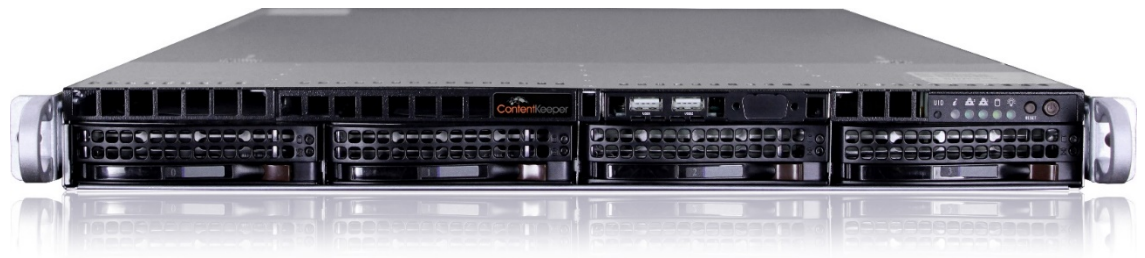
ContentKeeper TurboCache Appliance

You can purchase a CK-Cache license and enable it on a Web Filter Pro appliance or with other ContentKeeper applications, depending on the throughput requirements of your organization.